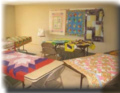
The Paint Chip Challenge Quilts from the October Meeting